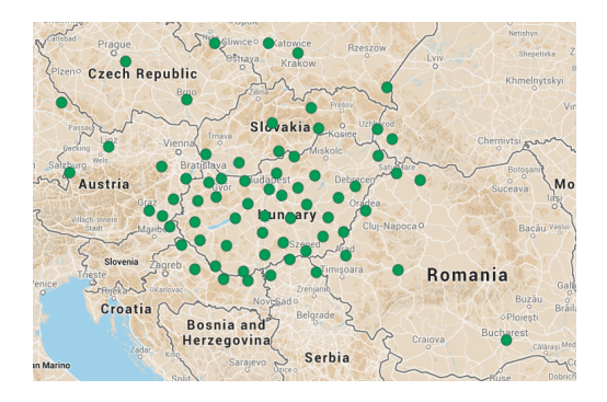
Selected stations inside AROME-Hungary domain by whitelist procedure (similarly as previous static bias correction study)