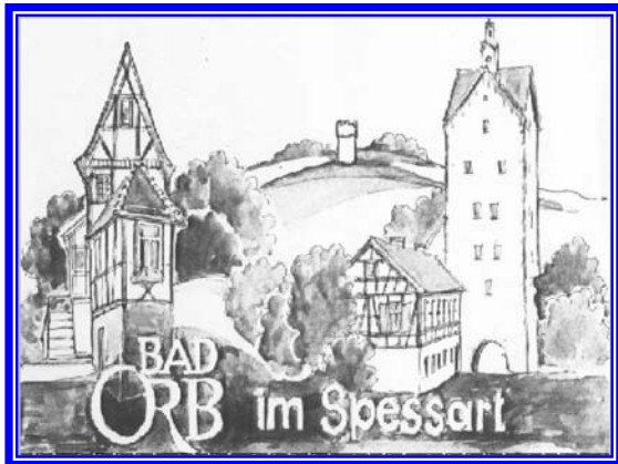
Bad Orb, Germany

The aim of the workshop is to provide a forum of information concerning all questions related to fine-scale modelling.